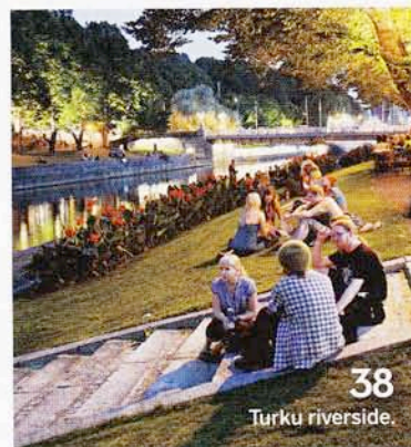
38 Turku riverside.