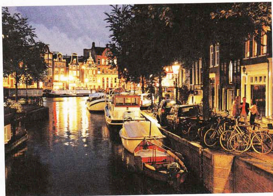
Still life: Boats line the Groenburgwal, one of Amsterdam's quieter canals.