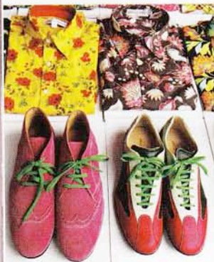
Clothing shop Adrian.

The Seven Bridges Hotel (from $151) boasts the view of seven bridges lined up in a row outside several windows. ■