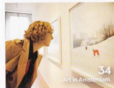
34 Art in Amsterdam.