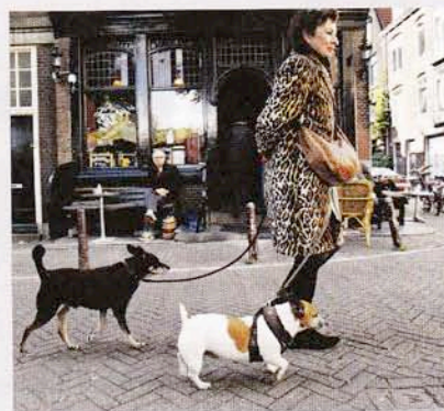
Pooch friendly: A stroll in the Noordermarkt.

5 HOUSEBOAT MUSEUM > This public houseboat on the Prinsengracht lets you sample the claustrophobic yet heady sensation of living life moored to the canals.